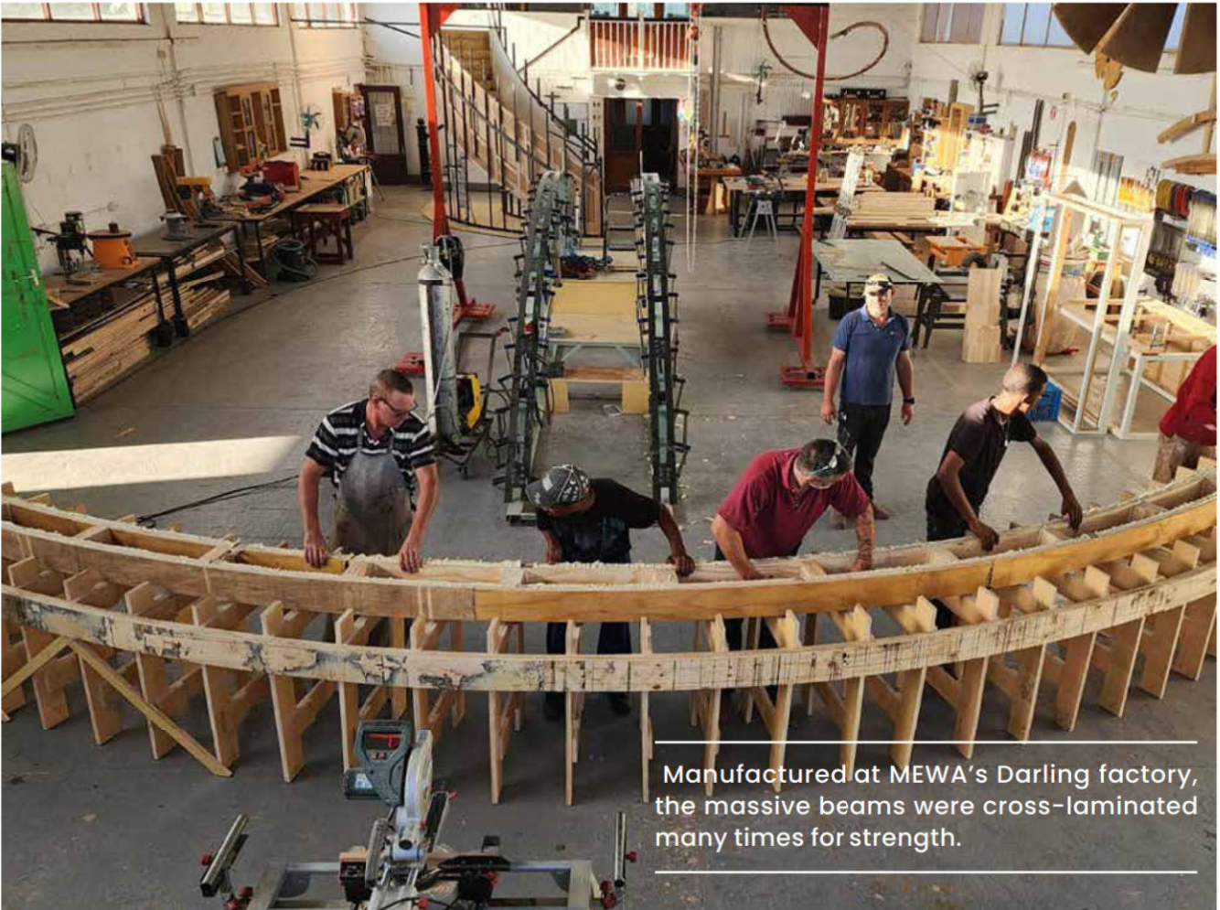
Manufactured at MEWA's Darling factory, the massive beams were cross-laminated many times for strength.